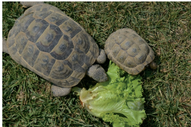
The Chelonia Project Garden provides a beautiful habitat, in which to study the animals, including the Greek Tortoises enjoying a lettuce snack (bottom).